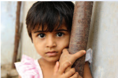
Child trafficking was listed as one of the 12 critical areas of concern in the Beijing Declaration and Platform for Action, adopted at the Fourth World

The Journalists and Writers Foundation, the Peace Islands Institute and Arigatou International – Prayer and Action for Children co-hosted a panel discussion on “Human Trafficking as a Form of Violence against Women and Girls” on the margins of the annual session of the Commission on the Status of Women. Representatives of civil society and faith-based organizations who attended the meeting emphasized the need for practical solutions and strategies to address the alarming worldwide rise in the number of trafficked children, and the targeting of children in this context as a form of modern slavery.